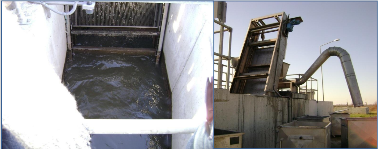
Anaerobic basin in the primary treatment unit of the Kavaja Plant